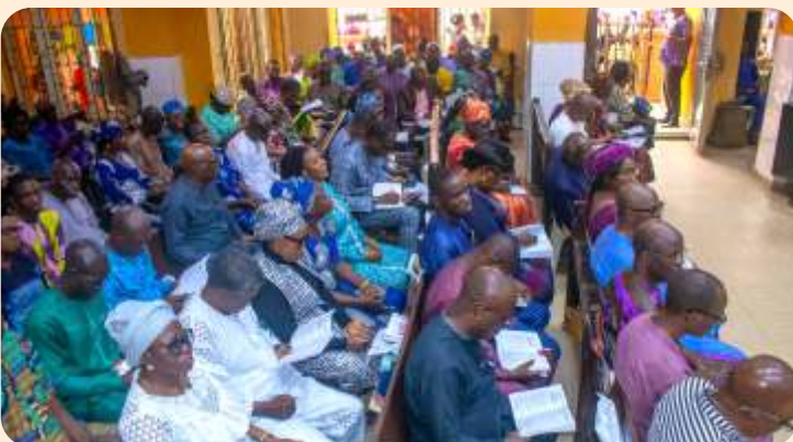
Kingdom Life Assembly (KLA) 2024