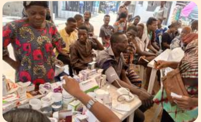
Medical Ministry to Area Friends at Mushin