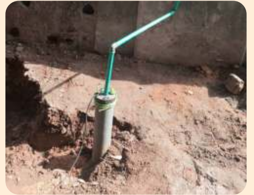
LEBC Mission House drilled borehole