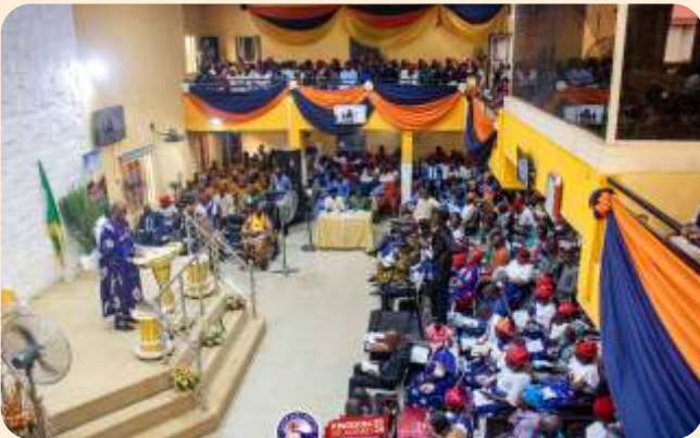
Kingdom Life Assembly (KLA) 2024