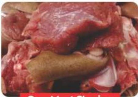
Cow Meat Sharing