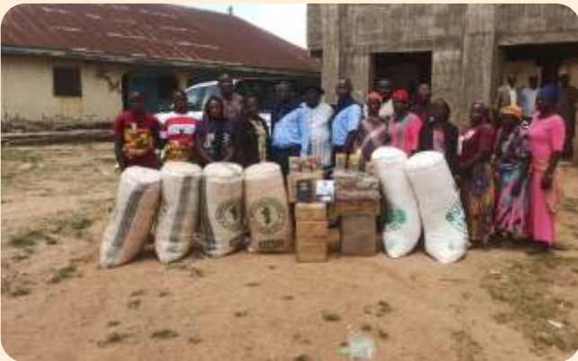
Relief materials donated to the vulnerables orphans, widows, pastors and students at the IDP center in Mangu, Plateau State