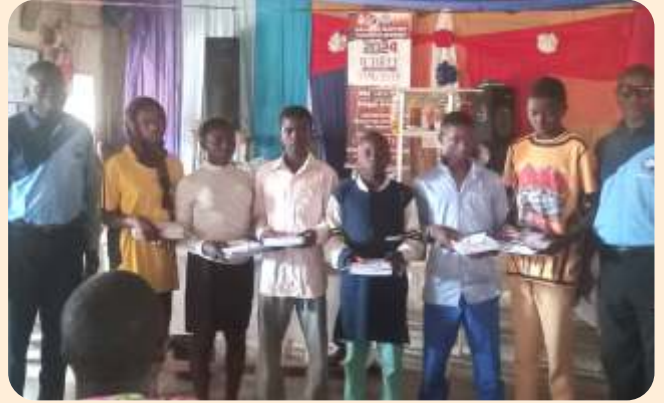
Award of scholarship to vulnerable prospective SSCE NECOWAEC students.