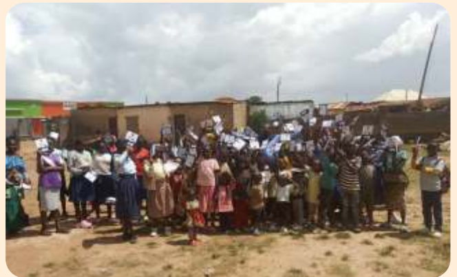
Go North Mission back to school support at the IDP in Mangu, Plateau State